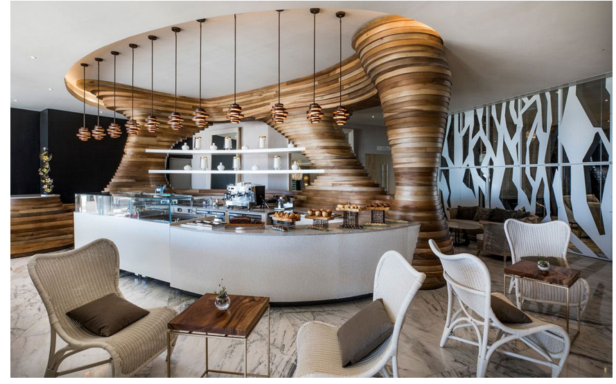
Oscartek GEM models an integral part of the transformation

connected to the common areas, which include living and dining rooms.