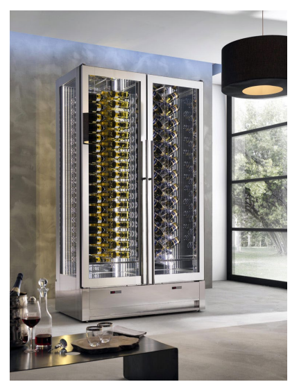
Oscartek; Ozone friendly Refrigerant

The extra expense comes in two ways: most all-stainless refrigeration equipment is custom-made compared to "off the shelf" galvanized components, and stainless steel is just more expensive than galvanized.