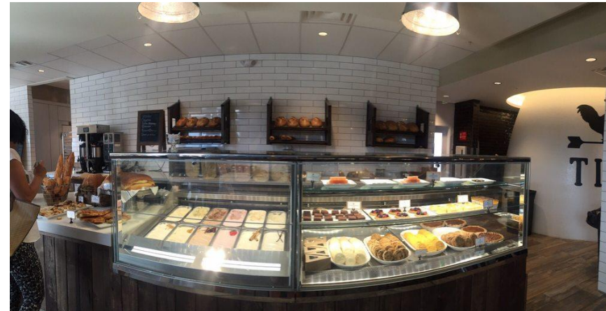
Oscartek Diamond model in multiple applications

TILL comes courtesy Altitude Hospitality Group, which also operates Garden of the Gods Gourmet Market & Café, Pinery at the Hill, and Taste at the Colorado Springs Fine Arts Center. During a media preview last week, co-owner Eric Allen indicated that TILL will act as a model for more planned expansions, perhaps to include a half-sized spot in Monument in the coming years.