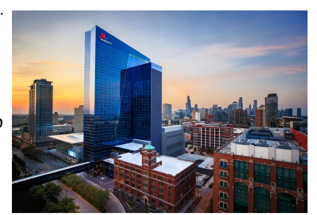
Marriott Marquis Chicago skyline

Designed to make a statement on Chicago's Near South Side, the building's dark blue glassy facade is punctuated by a bright red Marriott 'M' and color-changing zig-zag LED accent lighting. A number of firms—design architect Gensler, architect of record Goettsch Partners, interior designer Anderson/Miller, and interior designer of record Simeone Deary Design Group—collaborated on the project. The angular theme expressed in the building's exterior is carried over inside and also serves as a nod to Chicago's bridges and rail network. Meanwhile, carpeting with tire tread-like chevrons provides a nod to the adjacent Motor Neighborhood.