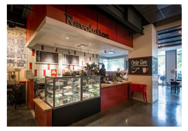
Oscartek Italia series at the café floor

Now home to 29 meeting rooms, the historic 1912 structure seamlessly connects to the modern Marquis tower. Inside, a subtle incline along the floor and a switch from all glass walls to traditional windows is the only real clue that a transition from new to old has taken place. The project reinforces its ties to its host city thanks to a curated collection of commissioned art pieces from over 30 Chicago-based artists. As a high-tech touch, guests can learn more about each work by scanning a unique QR code displayed with each piece.