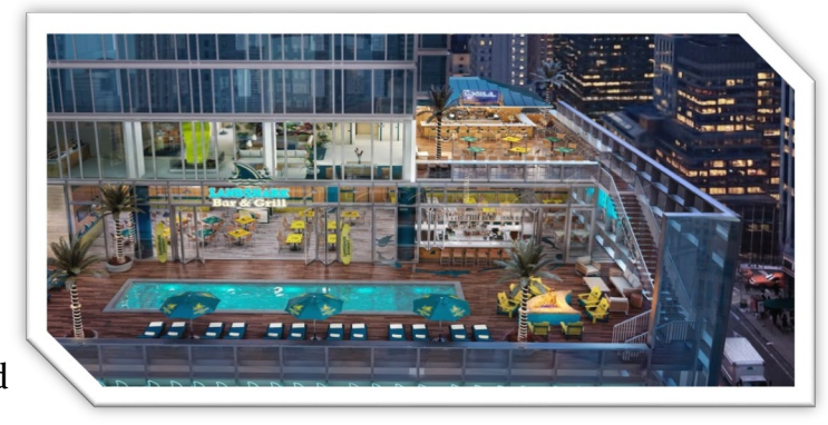
The views from the hotel's 234 rooms maximize the cityscape.

firm's founding in 1986. Its design of the Margaritaville Resort began in 2014, and construction, by Flintlock Construction Services, commenced three years later.