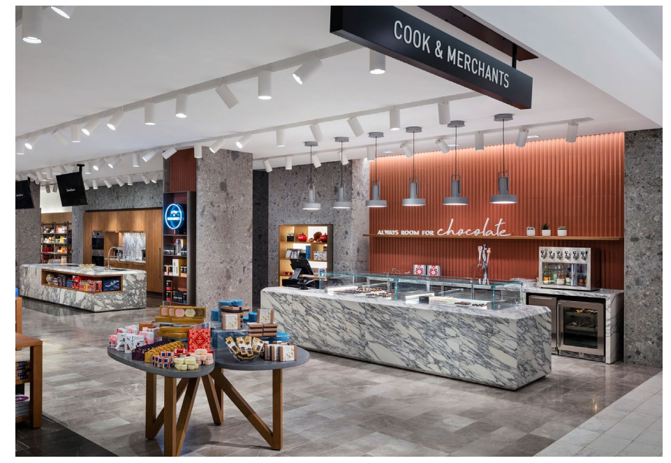
New Chocolate Store featuring Oscartek GEM model

Up on Fifth Avenue, Louis Vuitton has swathed itself in a psychedelic splash of pastel lights, while PayPal — the new kid on the block — is taking window shopping literally: Scan the codes in each of its five windows on West 44th Street off Fifth, and you can buy handmade toys, honey, chocolate and more from a bunch of small businesses.