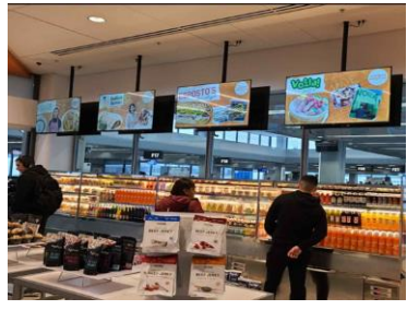
Pronto at SFO termial 3

NuChoice Foods believes their purpose is to create value by providing products and services that meet or exceed their customers' expectations. Integral to that purpose is to create value in and ensure the sustainability of the communities where they live and conduct business. To that end, NuChoice donates funds, volunteers time and contributes in-kind gifts to help improve the quality of life in these communities. Some of the groups NuChoice supports are Wounded Warriors, Wreaths Across America, USO, Toys for Tots, Habitats for Humanity, Food Banks, Ministries, Breast Cancer Association, American Heart Association, Children Hospitals, and Humane Society.