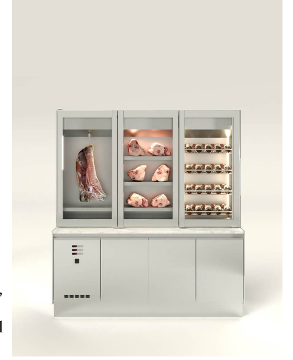
Dry aged meat, Cheese and Wine display (Oscartek Provino series)

Dual-zone cooler extensively caters to commercial spaces where the storage demand is high. They consist of two different sections with varying temperature options, thereby helping to store red and white wine at the same time. Single-zone cooling equipment is designed to hold a small number of bottles at a constant temperature. These coolers utilize thermo-electric cooling techniques and are witnessing adoption in the residential sector due to their energy efficiency. They are inexpensive and can hold up to 25 bottles. Single-zone cooling equipment is likely to witness increased combination sales in growing markets such as APAC, Latin America, and MEA The increased consumption of wine in restaurants, especially in Italy, Mexico, and the US is likely to emerge as a major driver of the growth of the commercial segment. Further, the increasing popularity of social drinking is expected to be a key influencer for the growth of commercial equipment. The growing disposable income, a high preference among millennials, and the need to prevent bacterial growth in drinks have