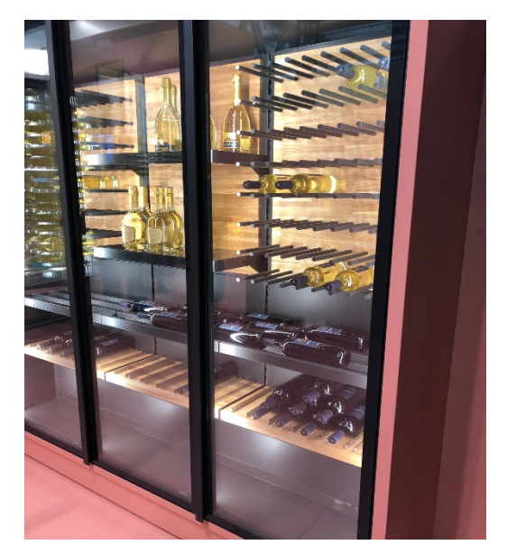
Multiple styles in wine display (Oscartek Gala models)

New technological innovations continue to offer advanced cooling systems and improved performance, while those who like to show off their collection have multiple options with the newest designs.