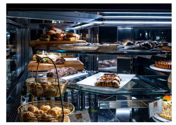
Oscartek Italia model at the Bank

The same can be said for Sacramento itself. Once described by now governor Gavin Newsom as "just so dull," California's capital is on a tear these days, transforming its longtime reputation as a stodgy political hub into a bona fide culinary destination and outdoor-recreation hotbed.