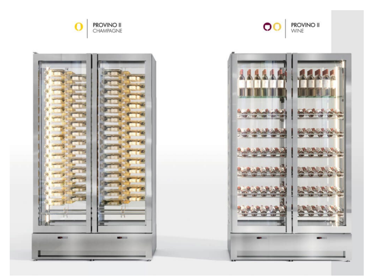
Oscartek Provino Wine Chillers

From multiple cooling zones to more flexible interiors and upgraded aesthetics, today's wine refrigerators make an elegant statement.