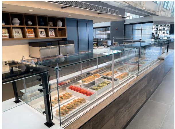
Oscartek custom display case

March 1st, 2024; Delta Air Lines continues to invest in modernizing and expanding the Sky Club network. Last year, the Atlanta-based carrier opened seven new and improved lounges, including a refreshed outpost in Newark, a gorgeous location in Minneapolis and a second space in New York's busiest airport. In fact, 2024 is shaping up to be the biggest year yet for the Sky Club network because Delta is officially cutting the ribbon on its long-awaited business-class-only lounges. In addition to opening three premium lounges, the airline has plans to build four new and expanded Sky Club locations across the country.