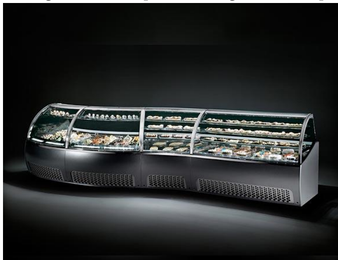
Oscartek Eco Friendly and efficient display model Cora

In addition to the food industry, refrigerated display cases are finding increased use in the biomedical and pharmaceutical sectors for storing medical samples and drugs at low temperature. The use of refrigerated medicine cabinets for storing medicines and cosmetics