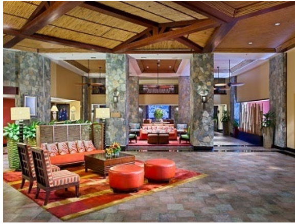
Oscartek new design elements as part of the remodel