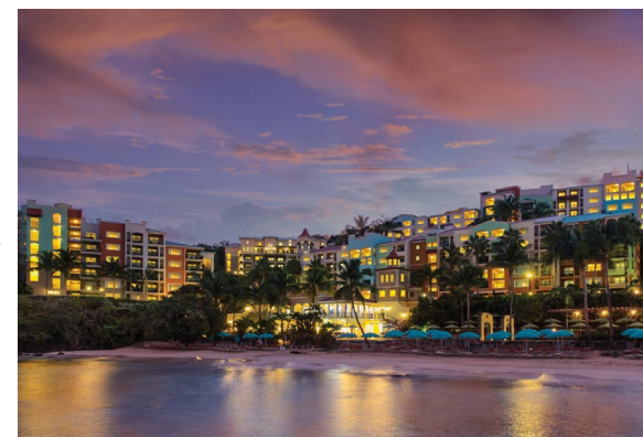
Frenchman's Reef in St. Thomas

For travelers planning on a summer time escape to St. Thomas, don't let the Frenchman's Reef makeover stand in your way. The Morning Star Beach Club, the Frenchman's neighboring sister property, will welcome guests seeking a summer retreat on the