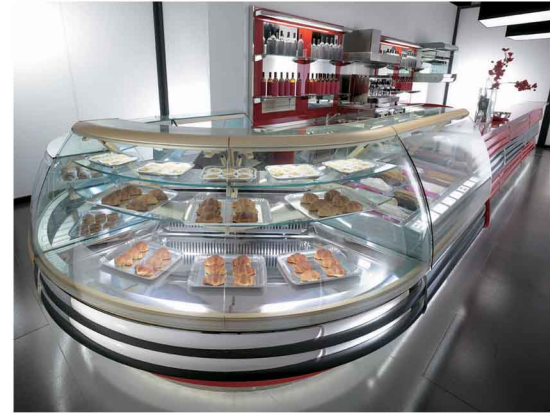
Photo shown is with optional front finish and champagne trim finish. Standard cases are silver trim finish, unfinished front, and stainless steel skin sides