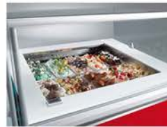
PHOTO SHOWN MATCHING GELATO