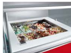
PHOTO SHOWN MATCHING GELATO